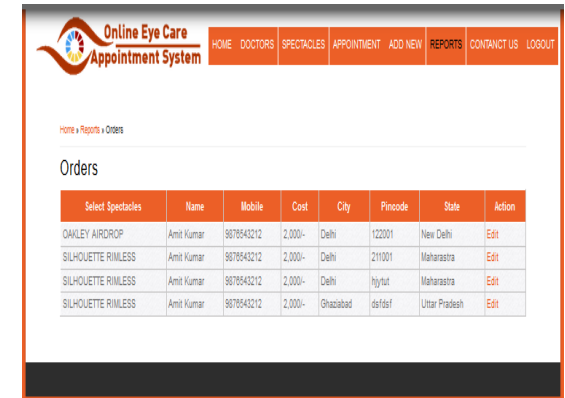
Spectacles Order List screen

“Do not hesitate to use Technology to care the Patient, feel the Comfortability, Security and Accuracy ”